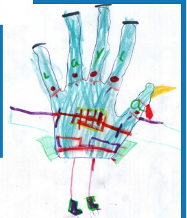
2nd place: Layla